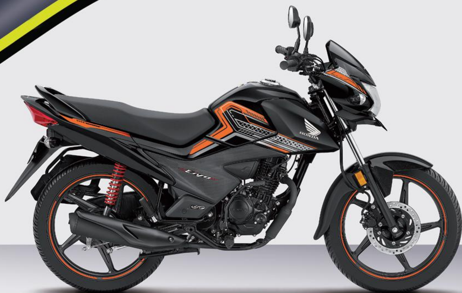
PEARL IGNEOUS BLACK (Pearl Igneous Black Shroud + Orange Stripes)