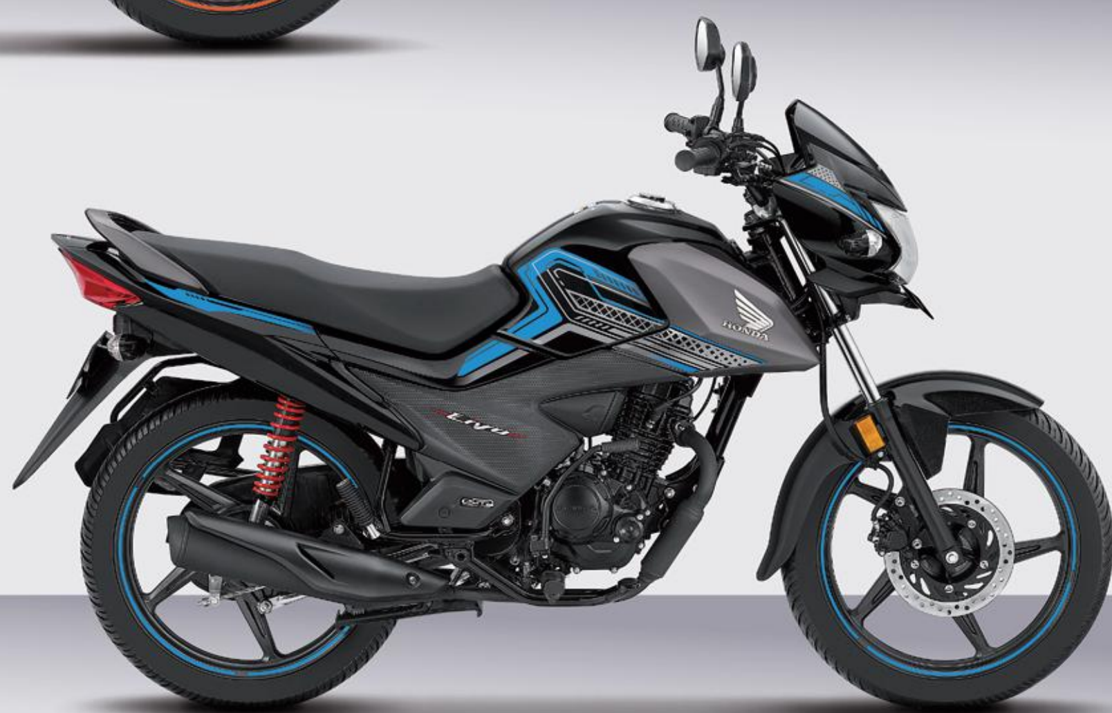
PEARL IGNEOUS BLACK (Geny Gray Shroud + Blue Stripes)