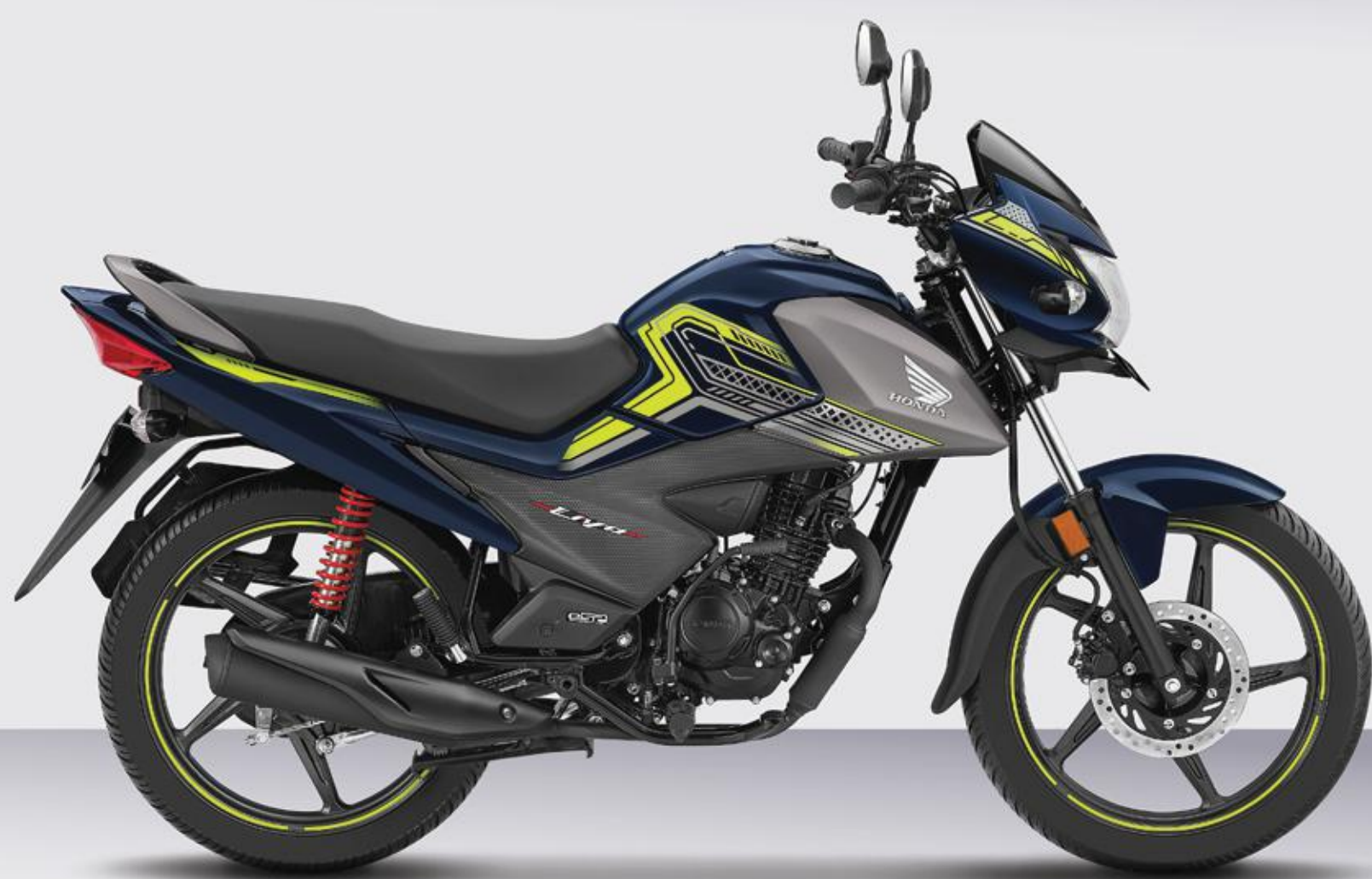
PEARL SIREN BLUE A (Geny Gray Shroud + Green Stripes)