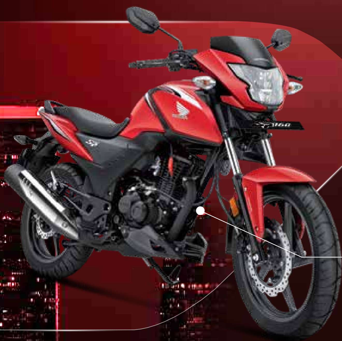
RADIANT RED METALLIC

The dynamic new color palette radiates confidence and style, making every ride a bold statement that says you've arrived.