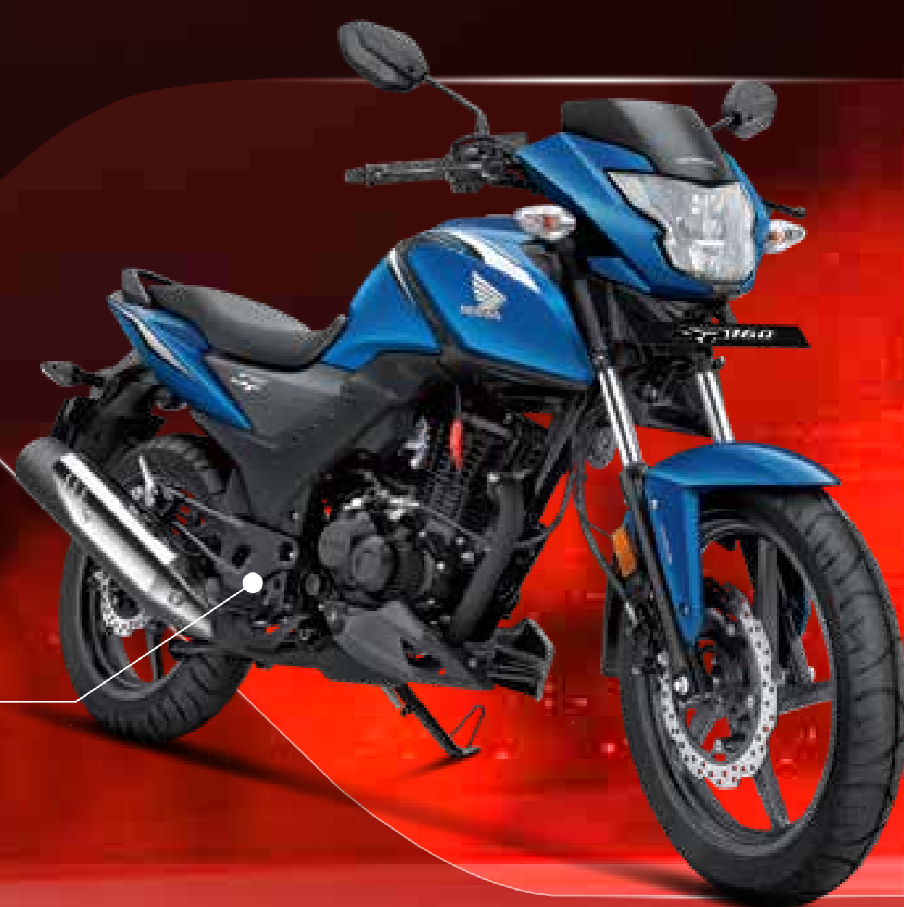
ATHLETIC BLUE METALLIC