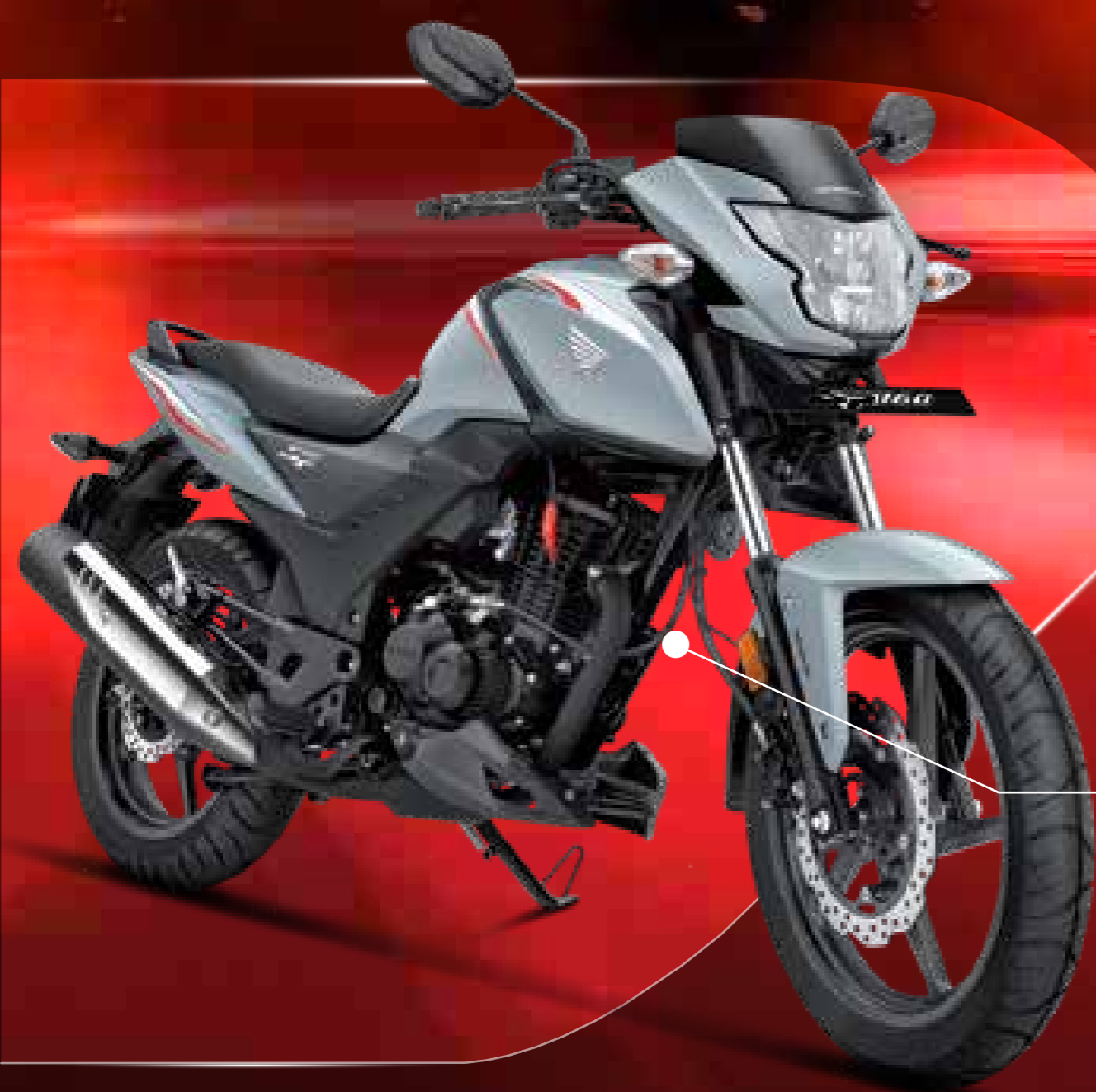
PEARL DEEP GROUND GRAY